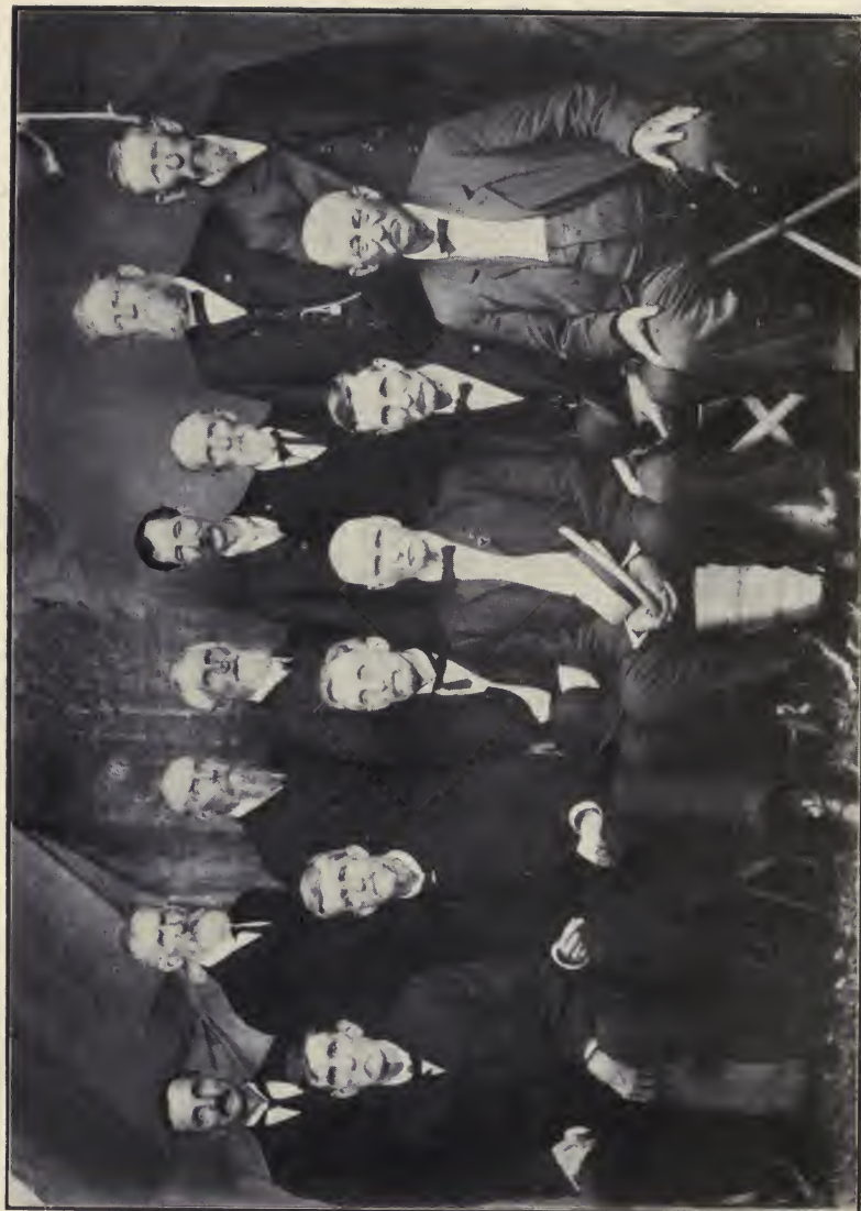
PHOTOS OF THOSE AT IMPROMPTU REUNION, BURGETTSTOWN, PA., JUNE 25, 1904