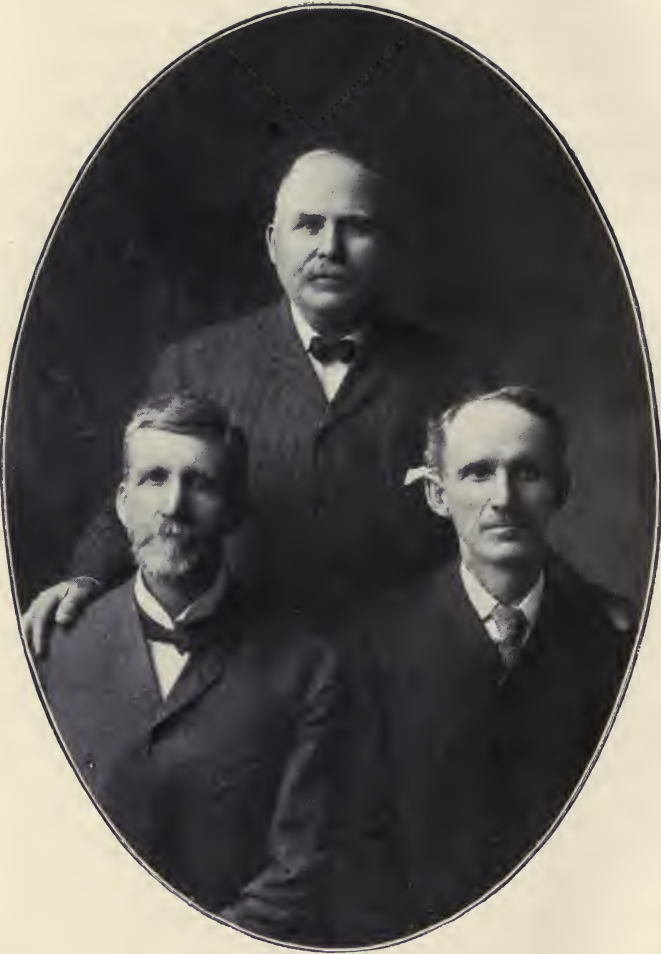
Comrades in Colorado